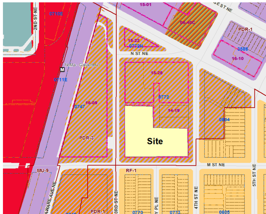
Figure 2. Site Location